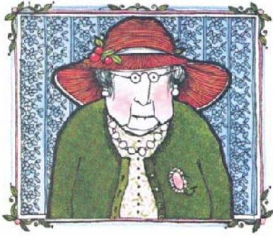
Poor Old Polly